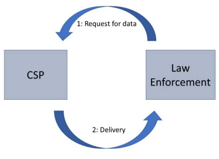
Figure 1: Reference model

Request means submission of a request for data and delivery means handover of the material that was identified by the CSP as meeting the request. Figure 1 shows the reference model.